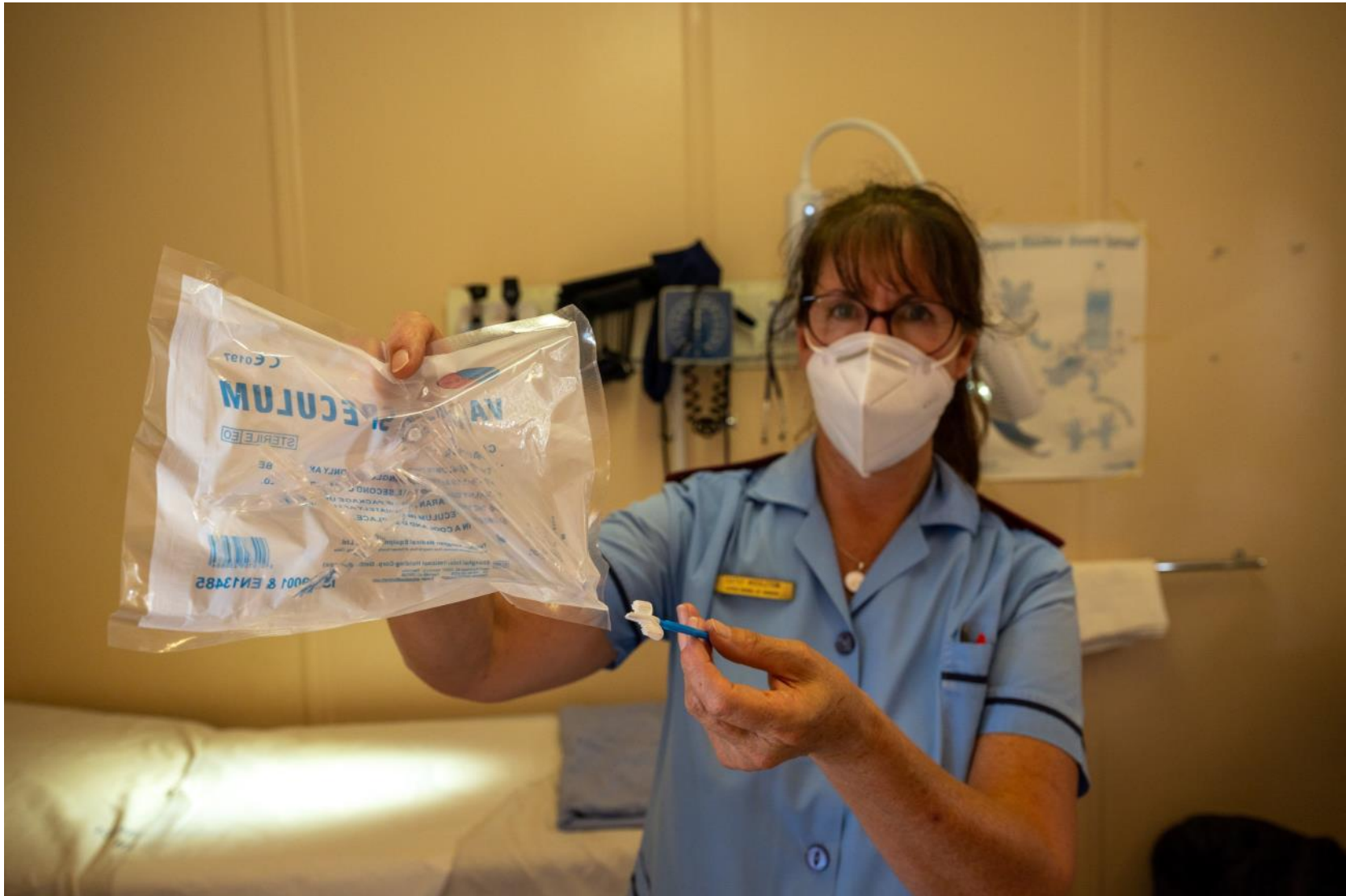
2 Midwives were doing pap smears and assisting the GP in four clinics.