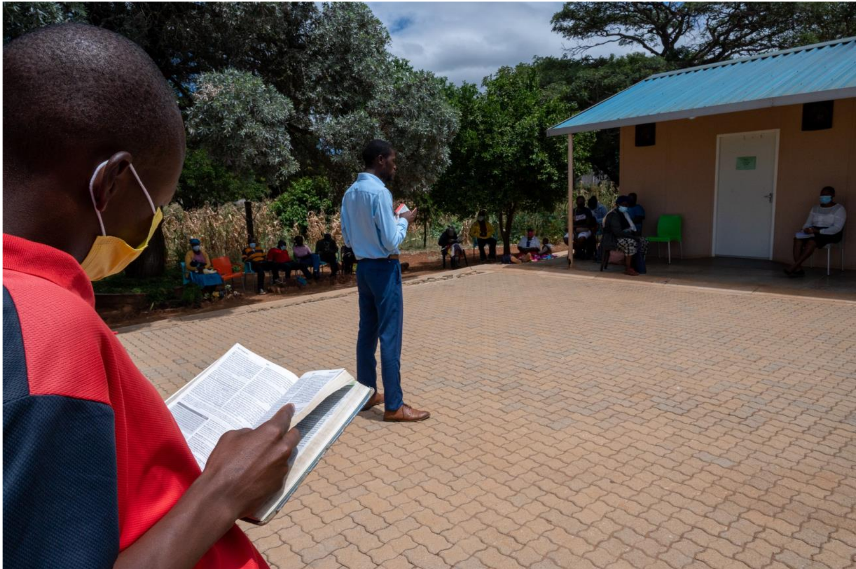
Two evangelists from Zimbabwe and Limpopo teamed up to preach the gospel to waiting patients and minister to people they encountered in the communities.