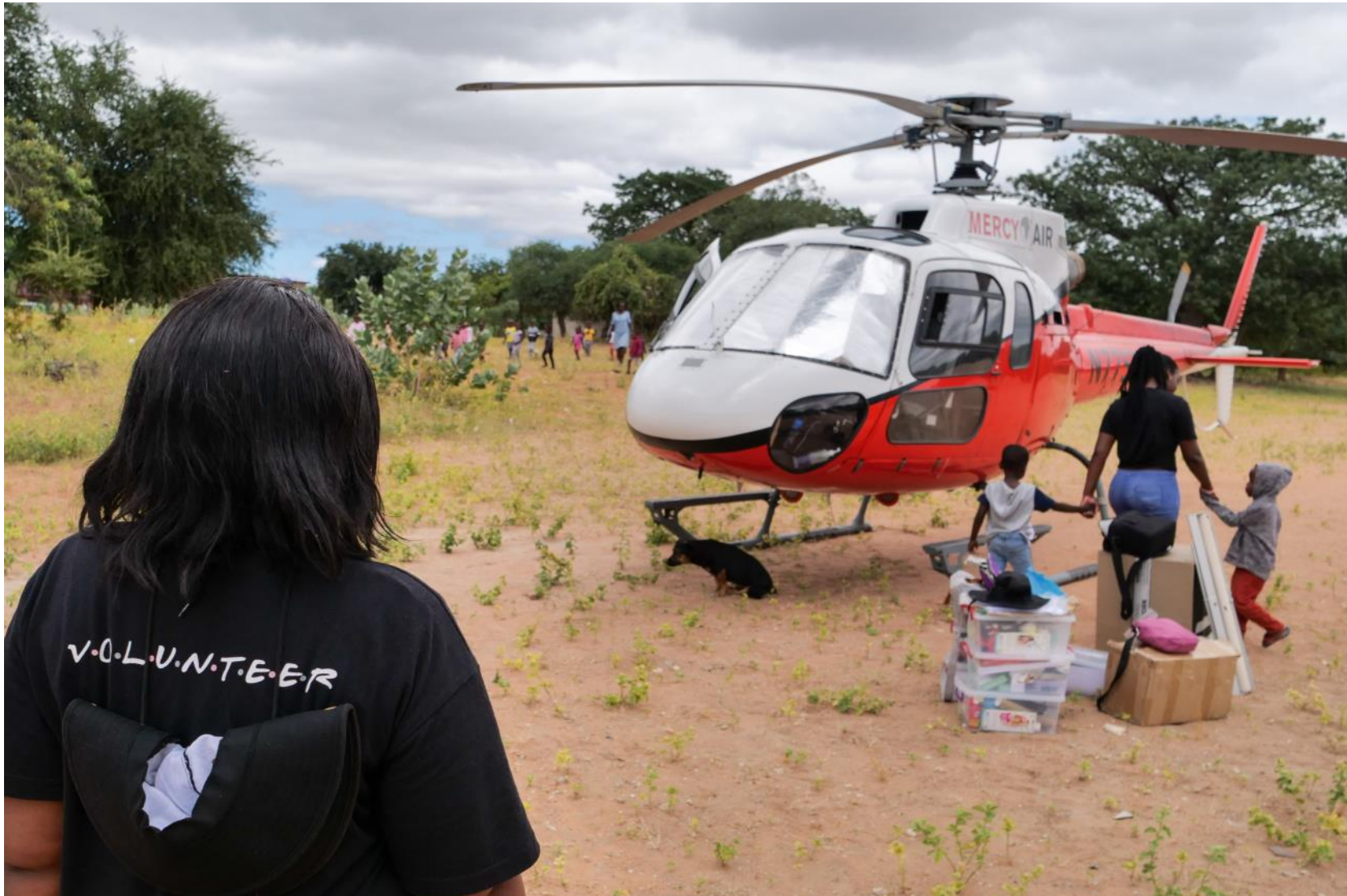
2 Volunteers from GFPA, Africa's girl fly programme, visited 4 secondary schools to educate students about Aviation.