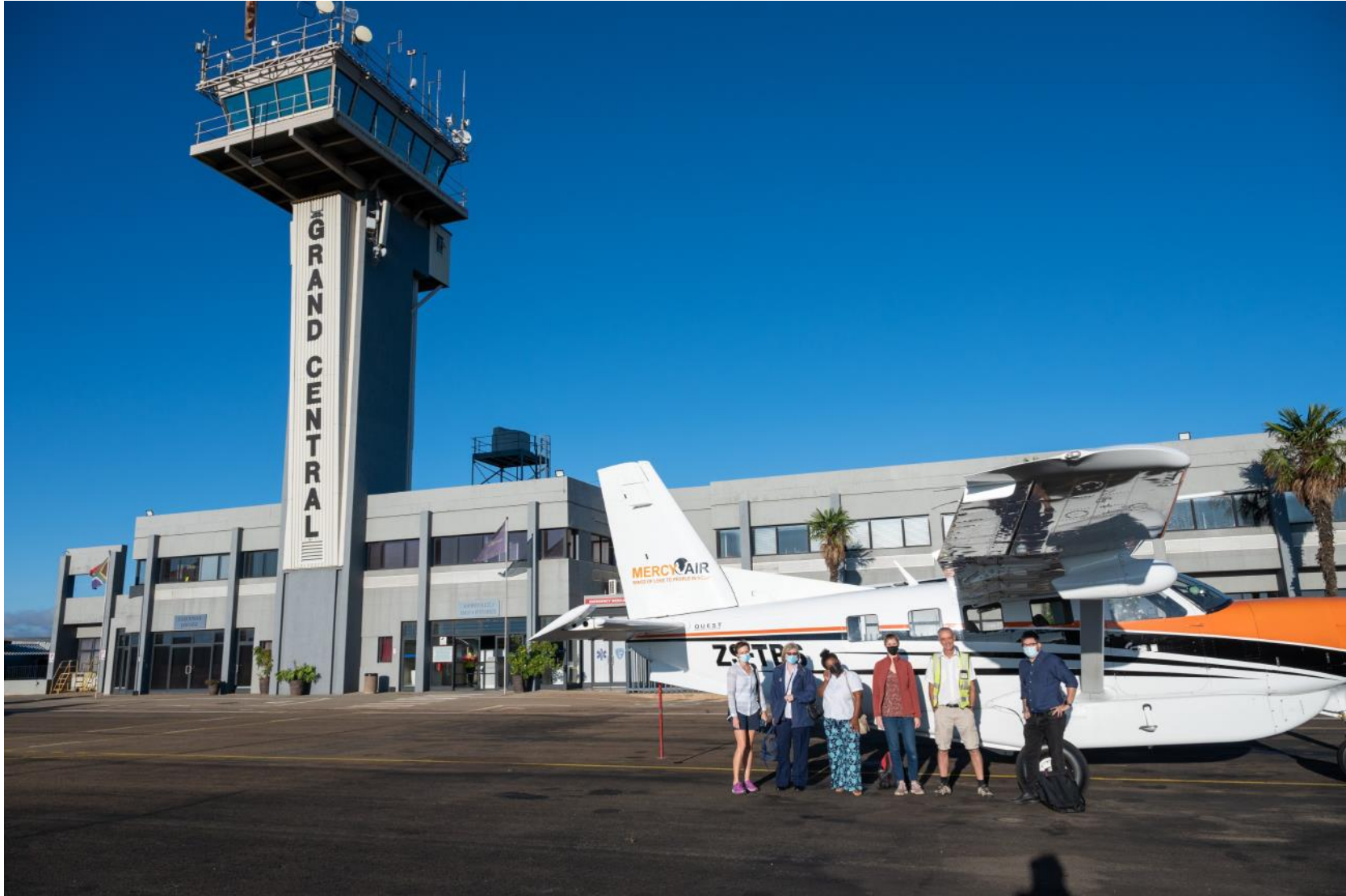
Medical specialists picked up from Grand Central with Kodiak and from White River with Helicopter, then flown to Matibe Airstrip in Limpopo.