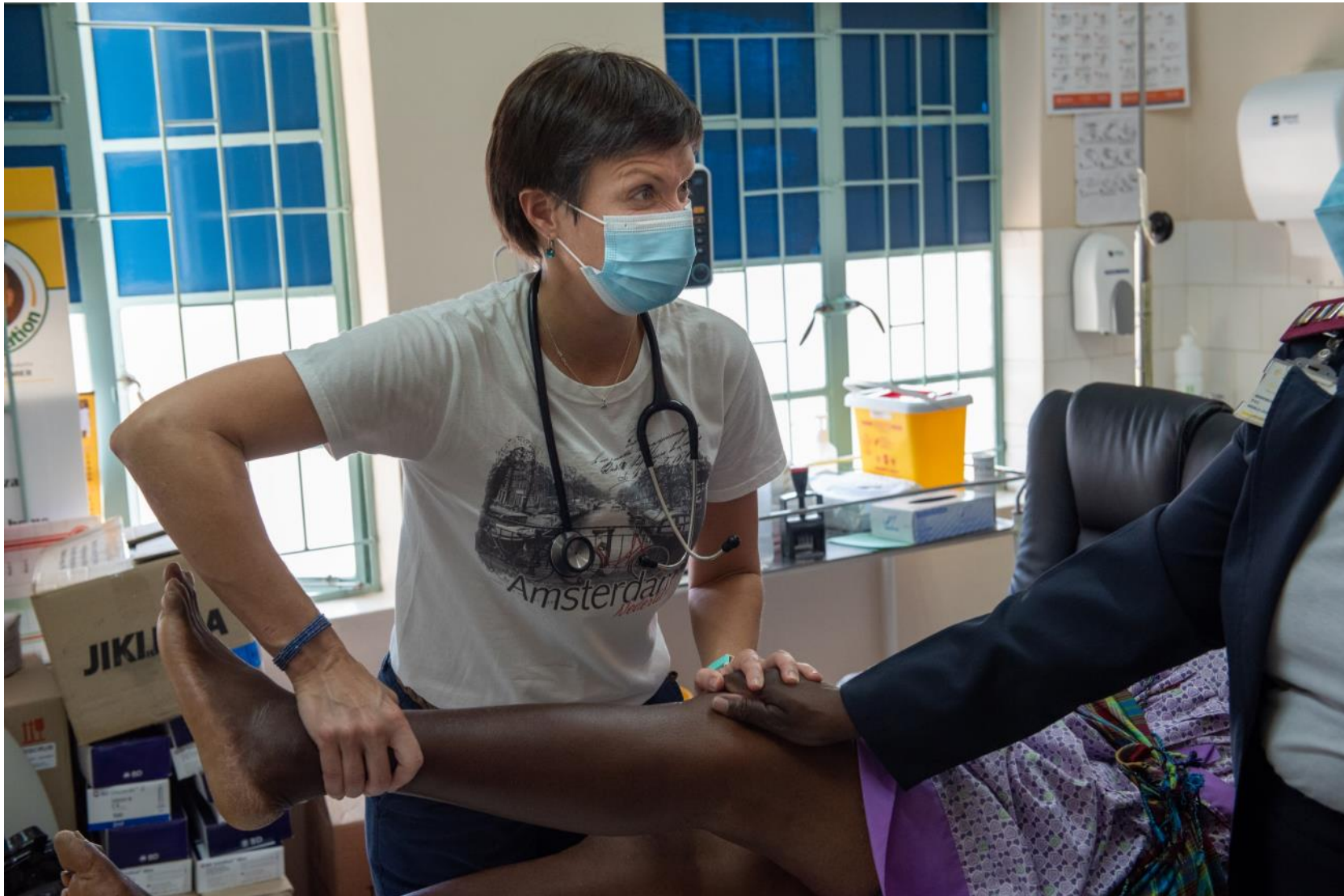
GP Cecilia helped over 81 patients. Even though clinics are spread out through Vhembe district, doctors and specialists are a rarity.