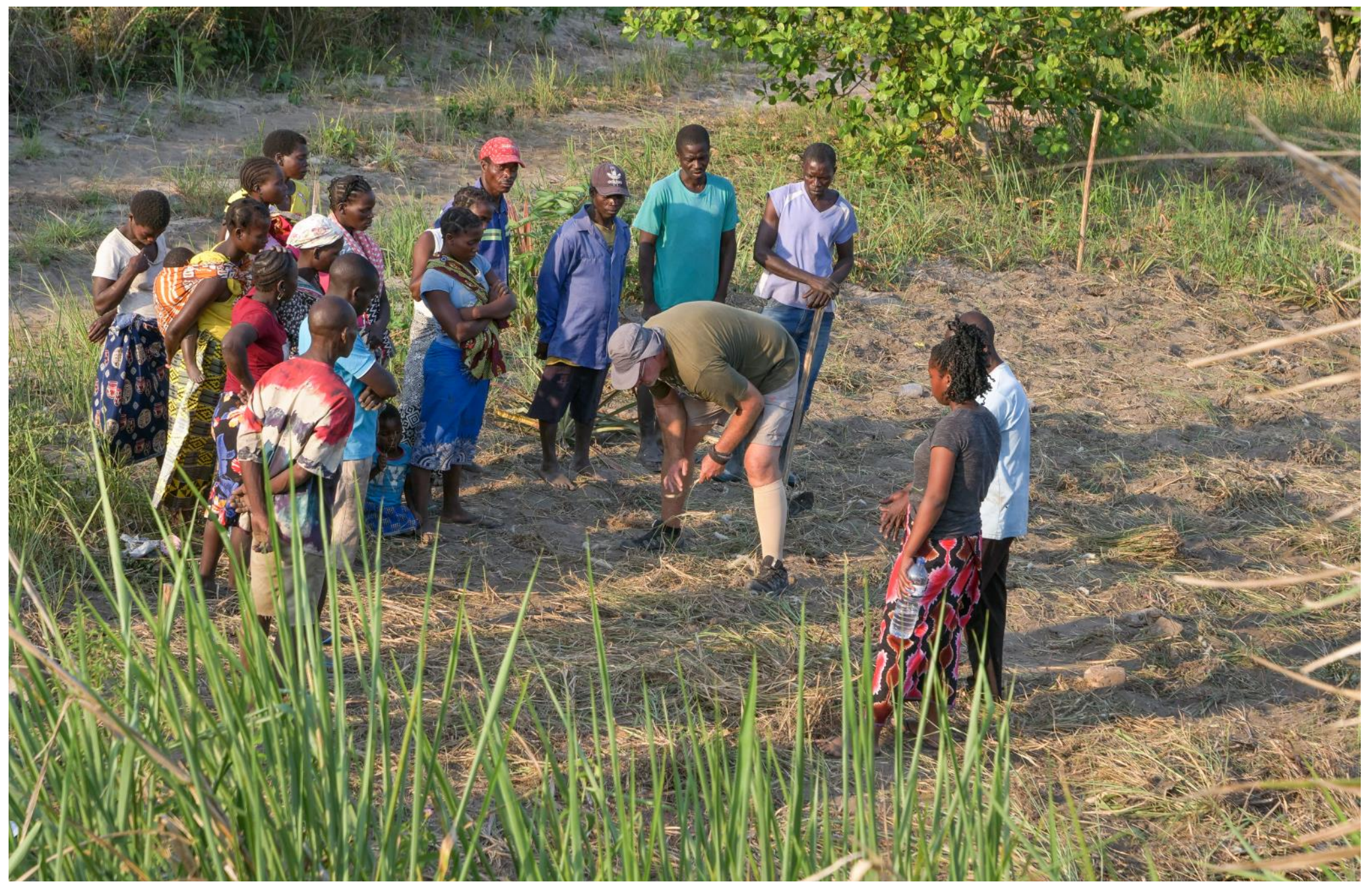
How to prepare the soil