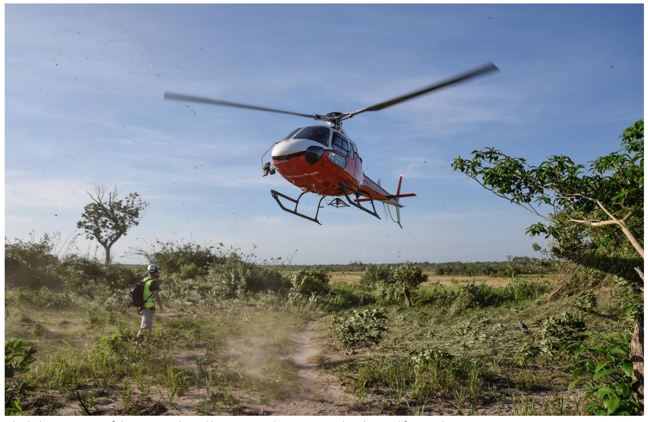
The helicopter - one of the great tools God has entrusted Mercy Air with to be used for His glory.