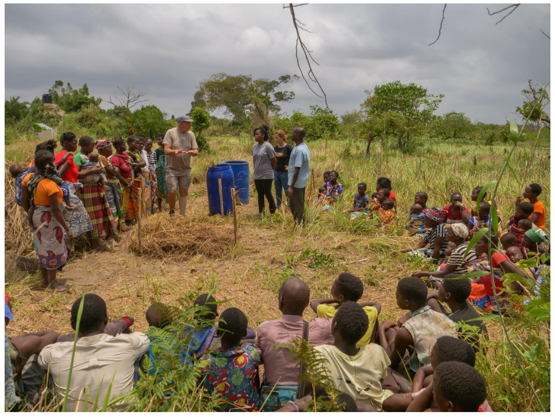
How to make compost