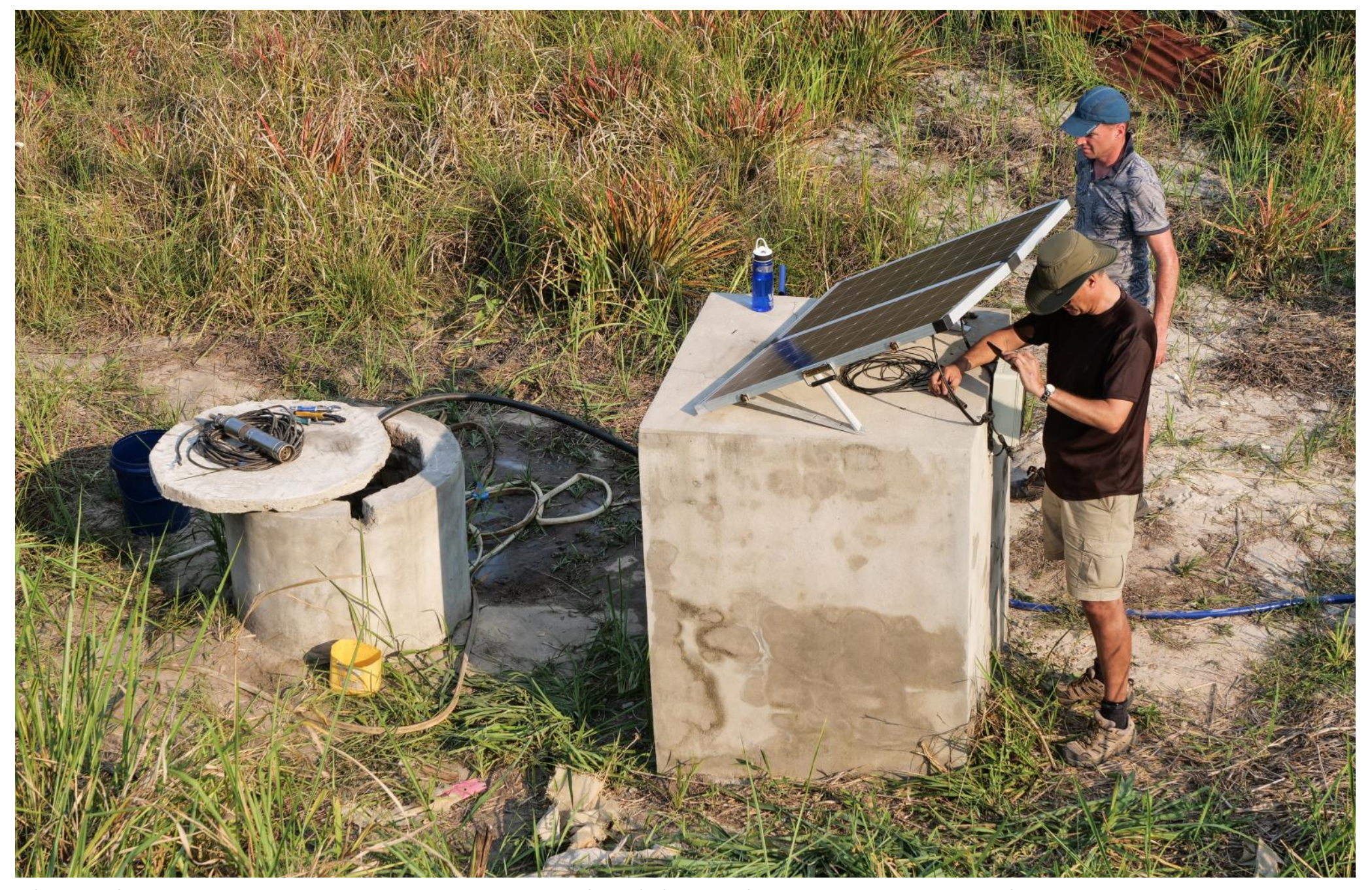
There is always opportunities to support missionaries in their daily struggles. Sometimes as essential as water pump issues.