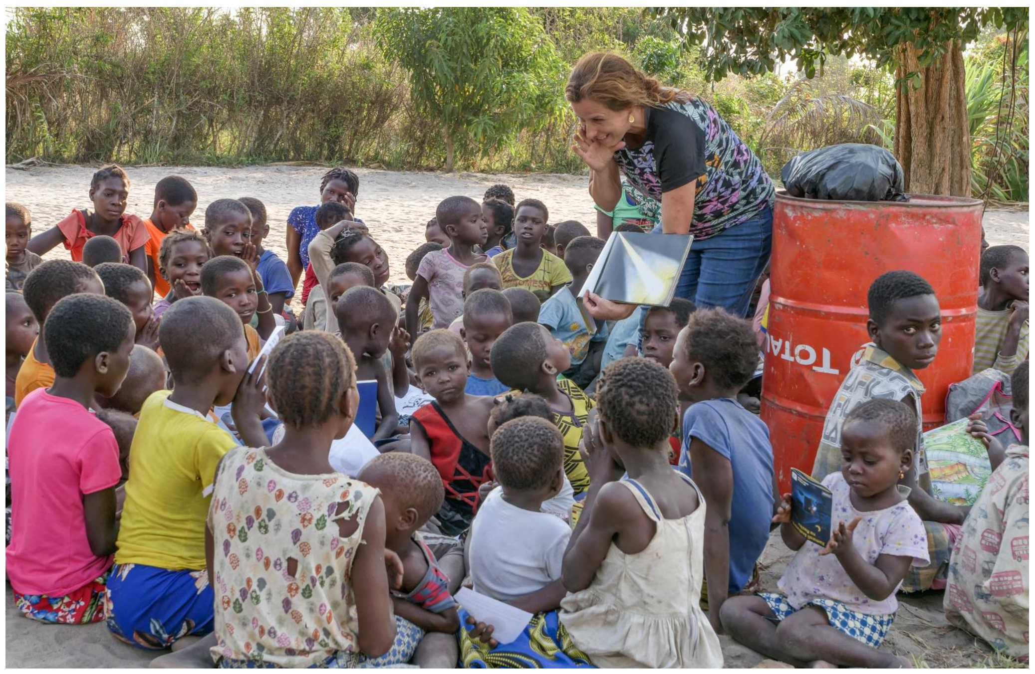
Aren't stories exciting for kids...?! Why not tell biblical stories...?