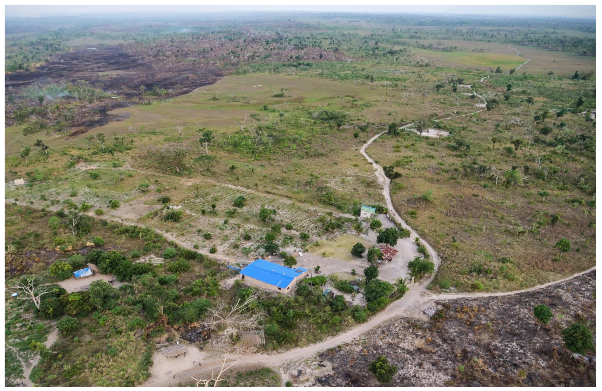
IHOP mission base in Nhamisenguere in development.