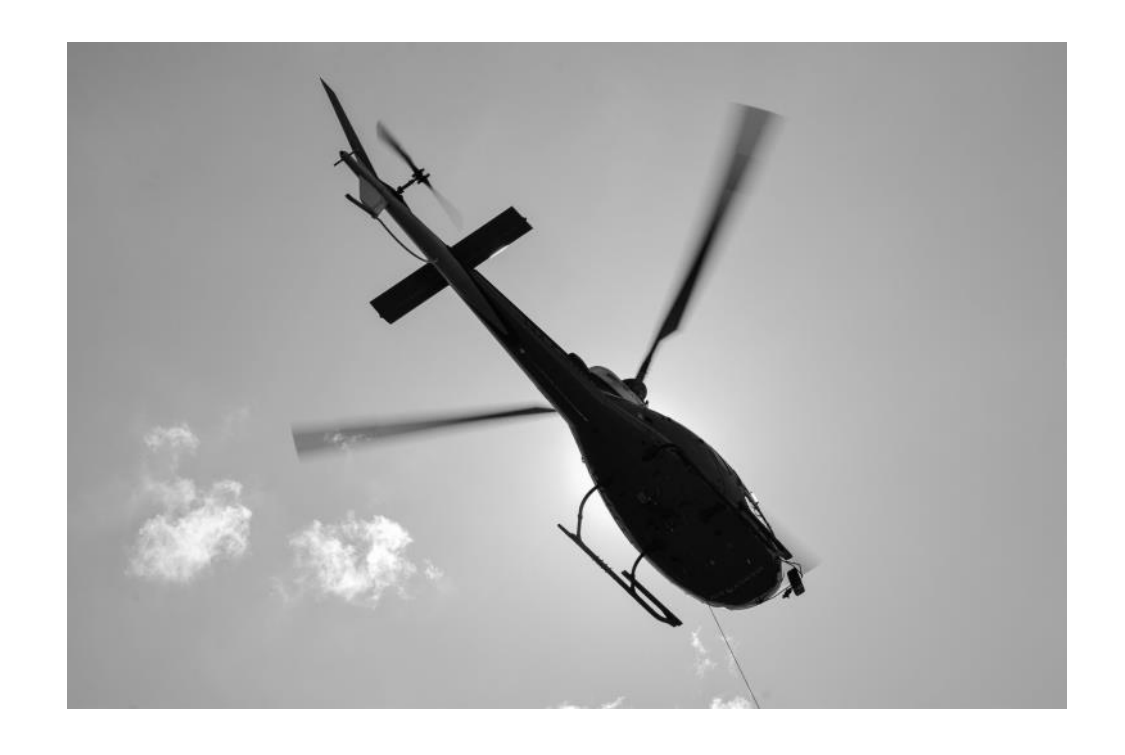
Visit <u>www.mercyair.co.za</u> for more information.

Mercy Air is grateful that we are part of God's work in Southern Africa. Many supporters, partner and volunteers help to make this possible. Many thanks, and may God bless you all.