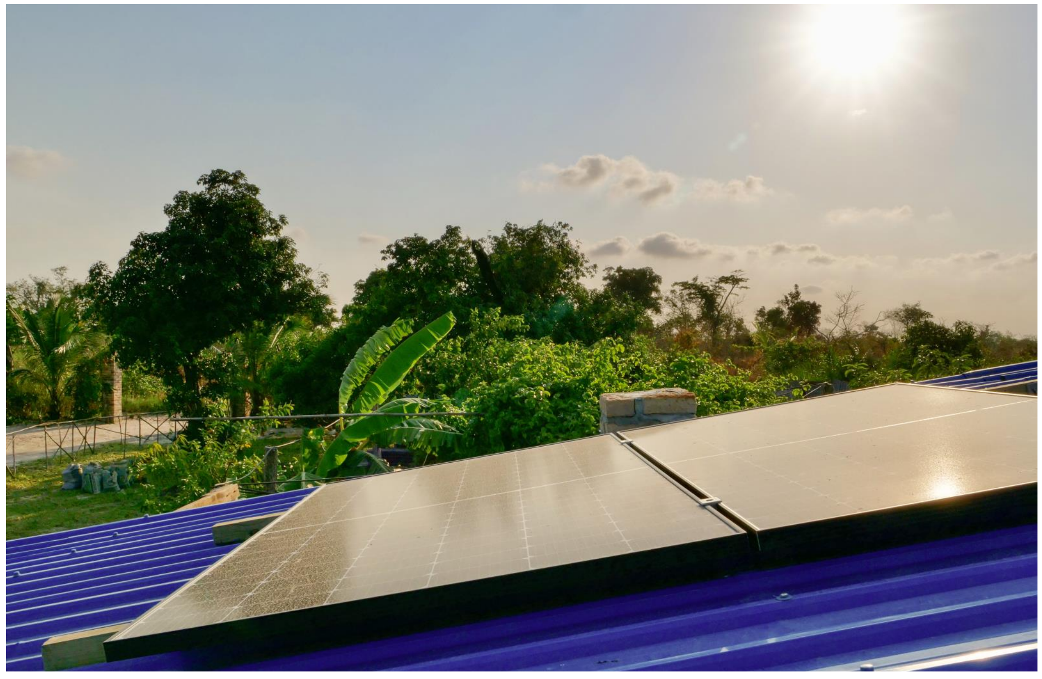
The sun, God's gift to make electrical power where there is no chance of getting access to the grid.