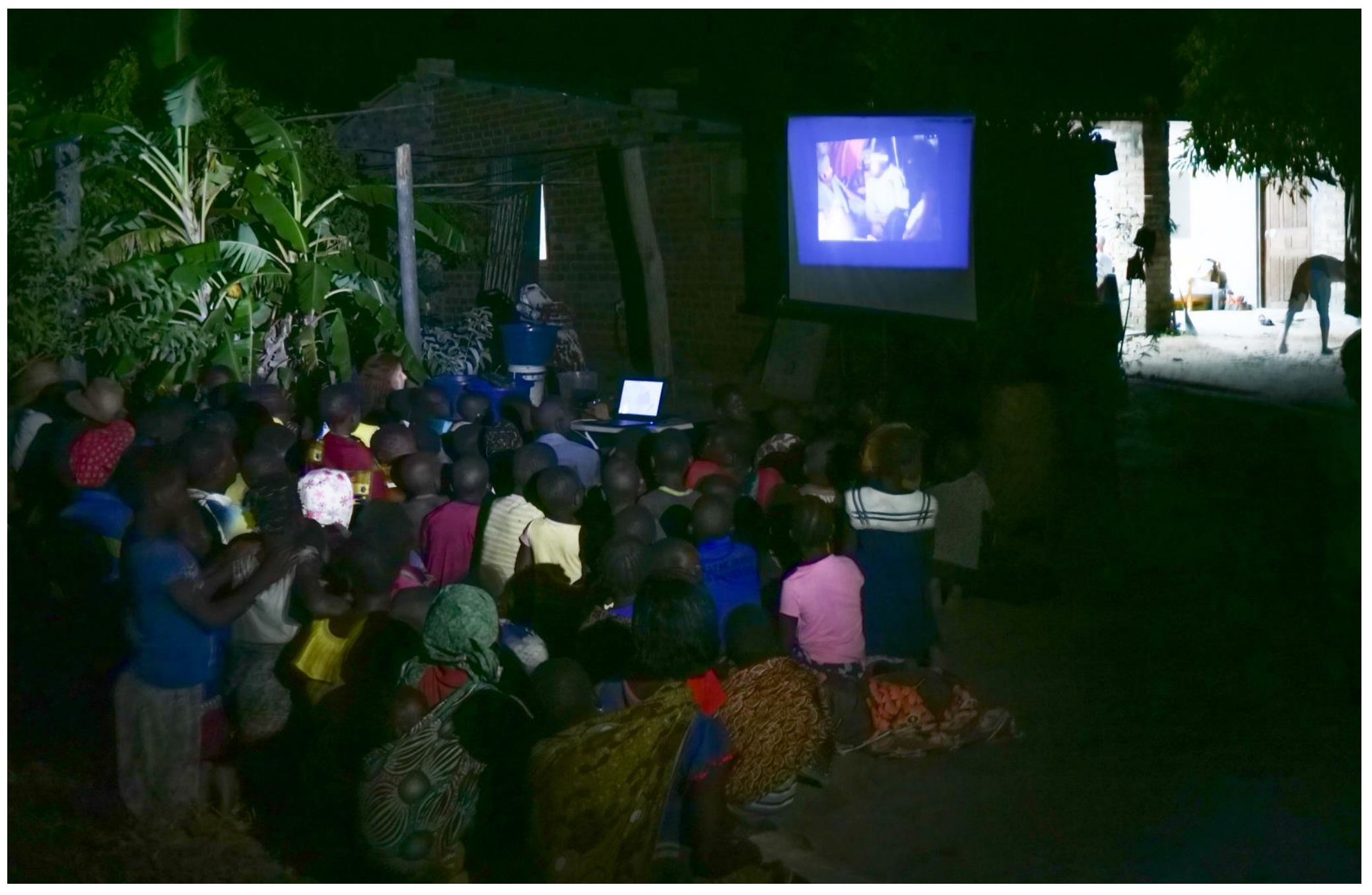
Jesus film in the evening—thanks to the solar power we installed the day before!