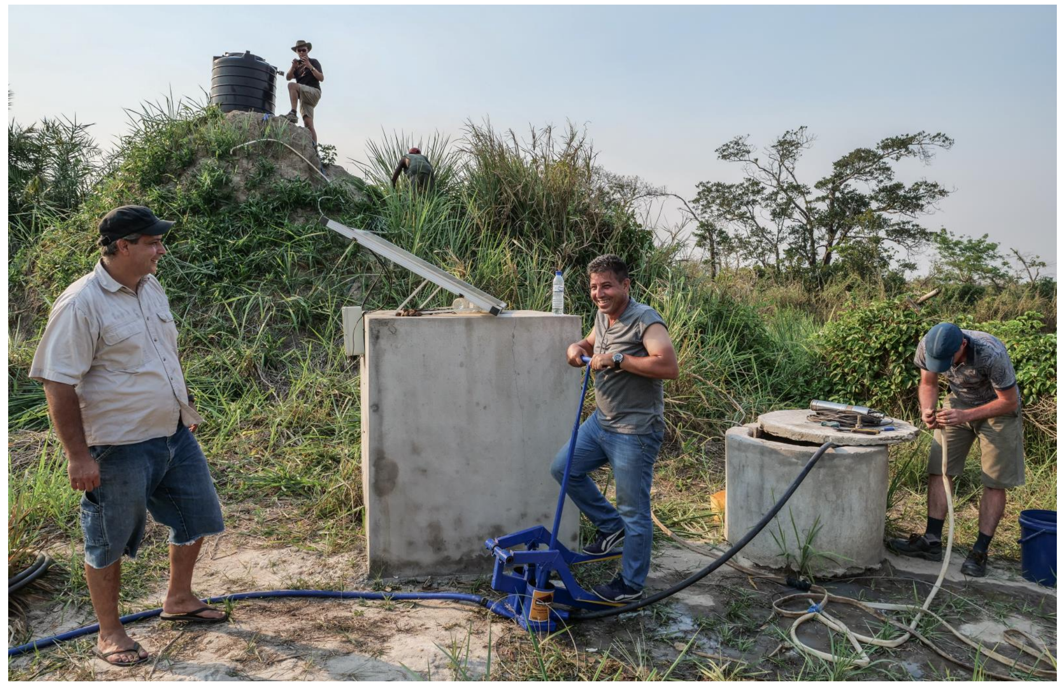
Missionaries and Mercy Air volunteers working together towards the same goal.