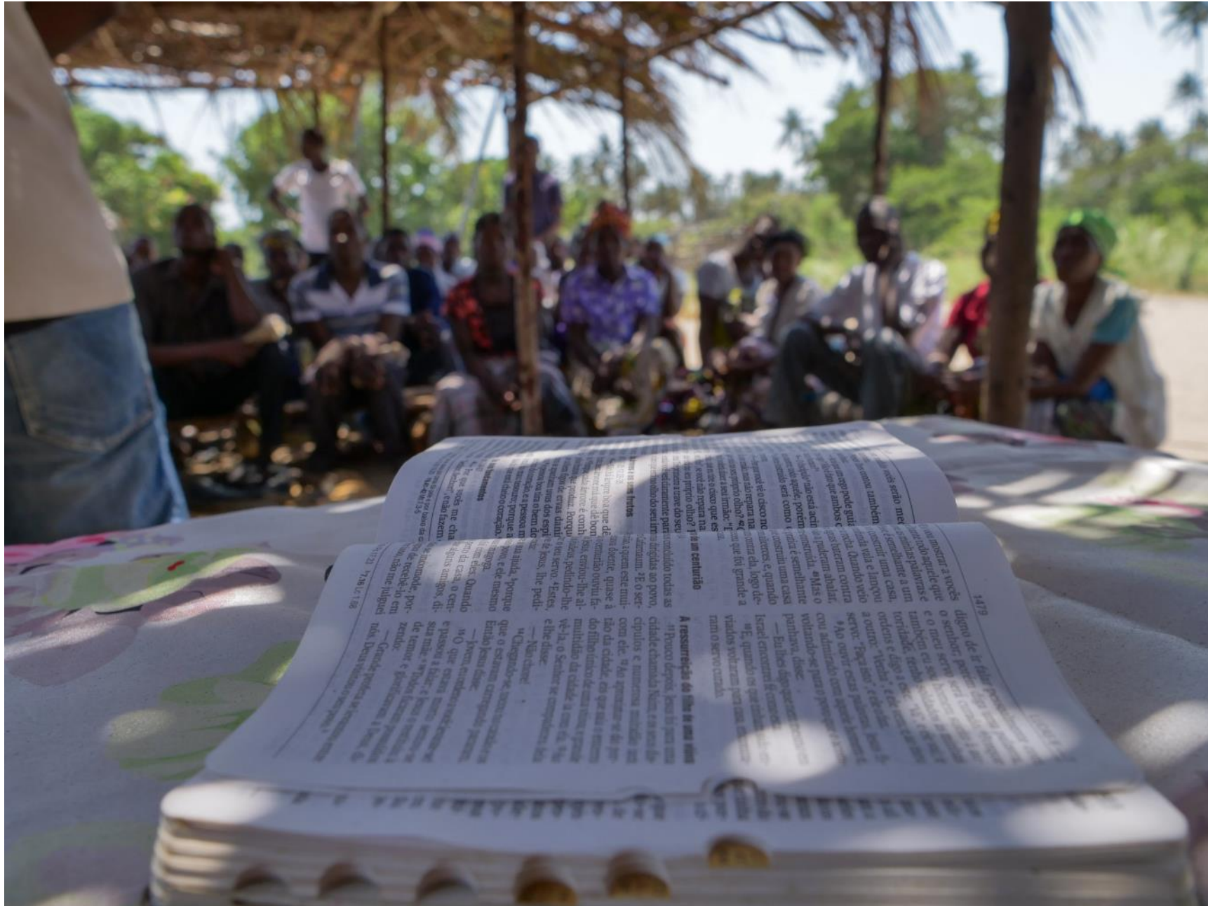
Church Leadership Training