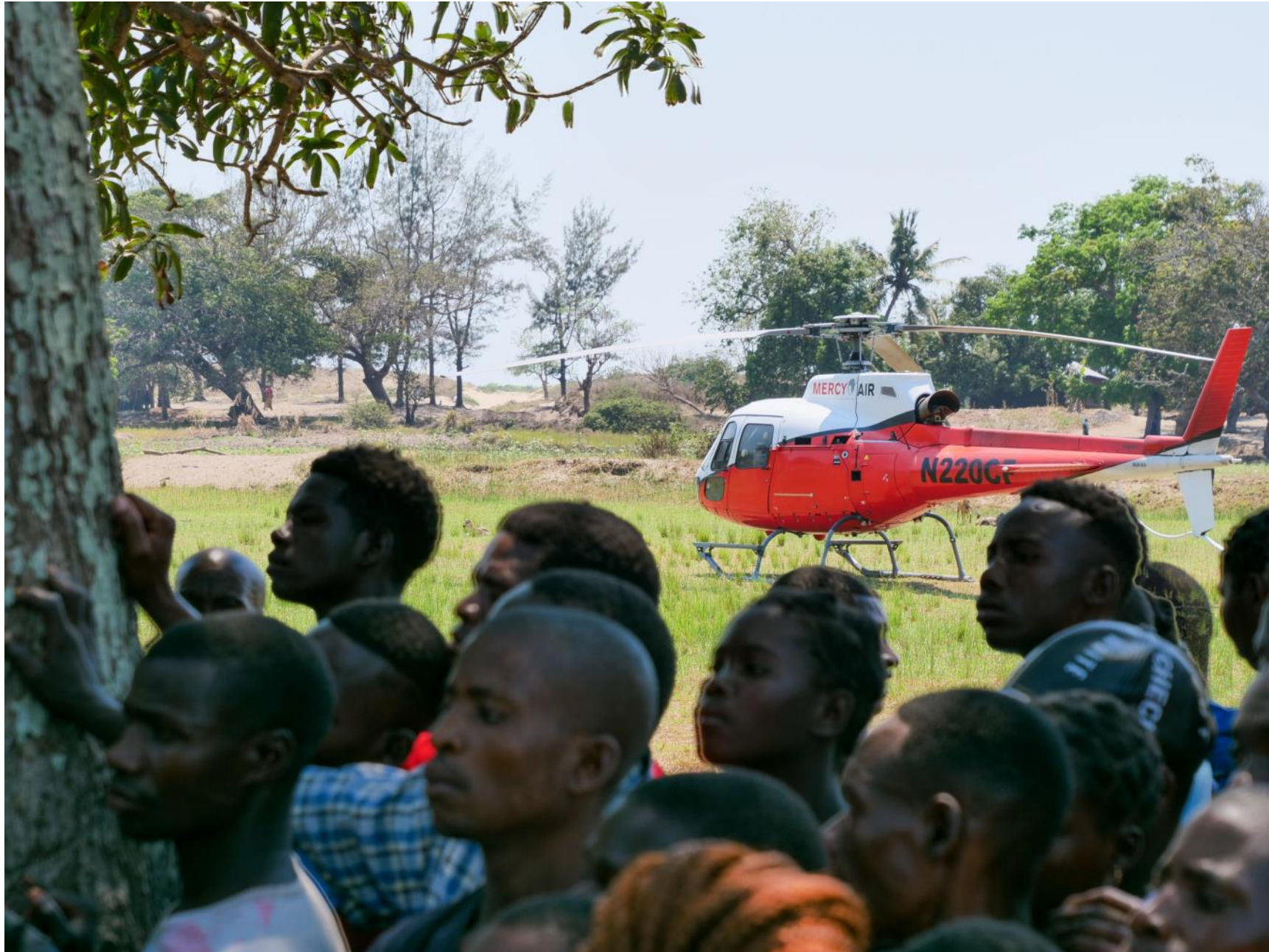
Visiting a place for the first time always draws a crowd...