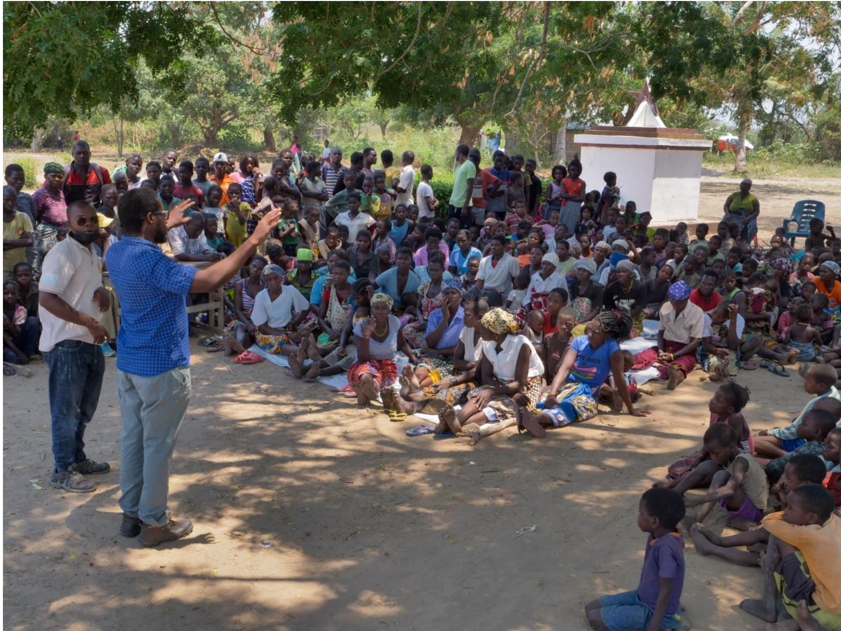
More than 300 people heard the gospel in Mitange.