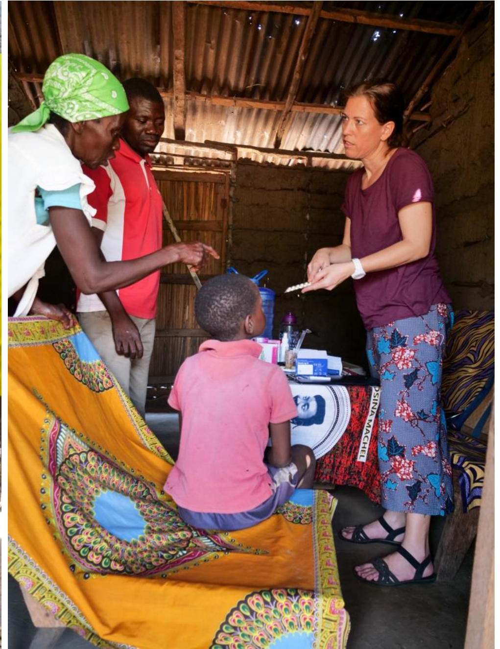
Medical Consultations. All the team members are trained and registered health workers.