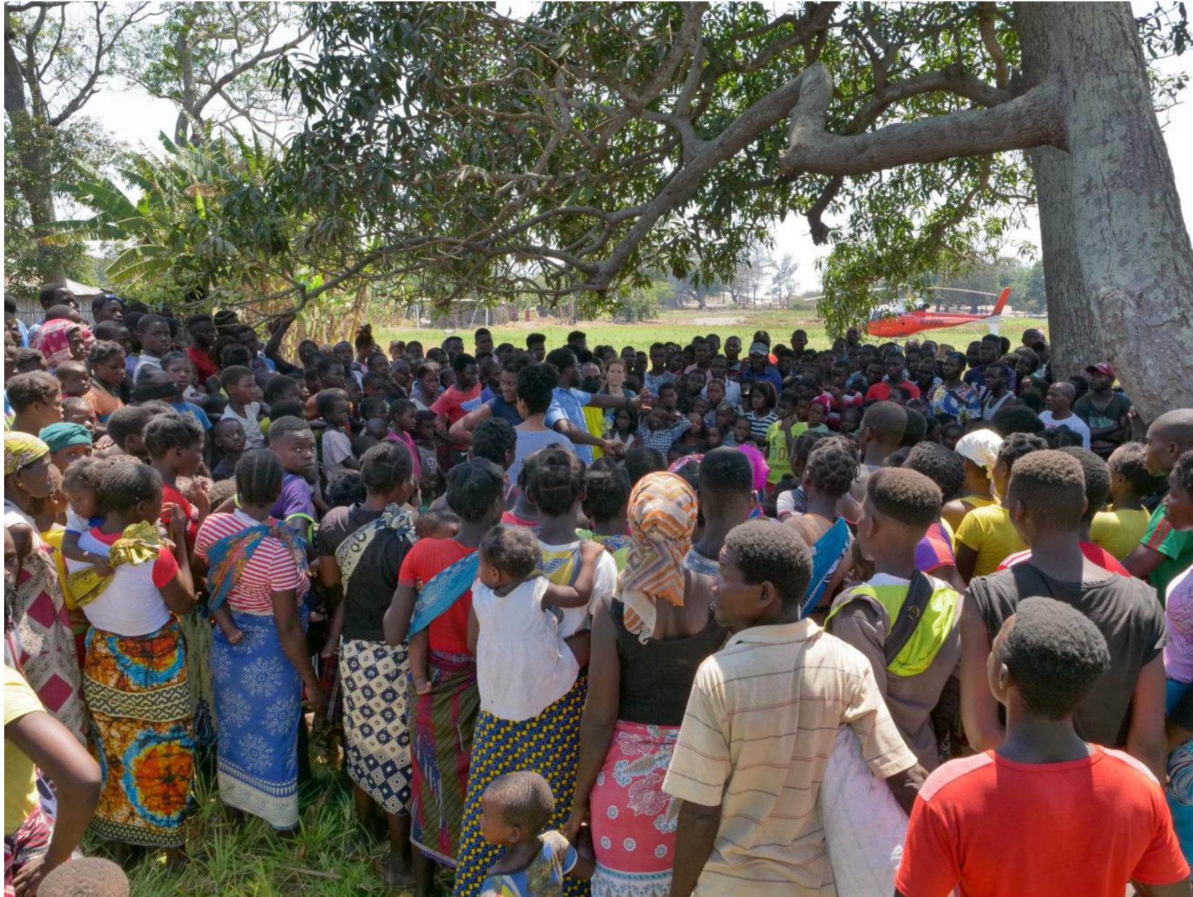
Several hundred gather in Olinda to hear what the visitors have to say....