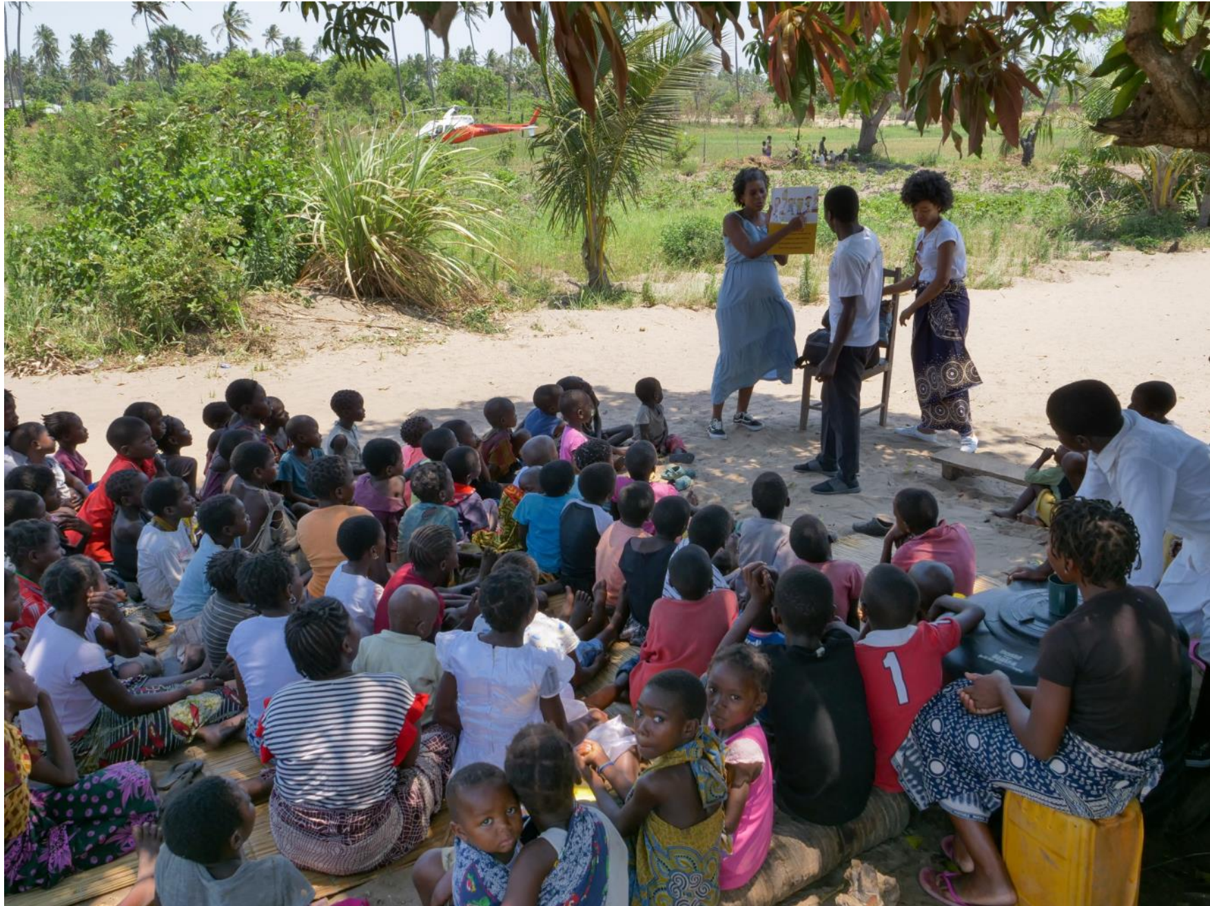
...teaching them that God loves them all...