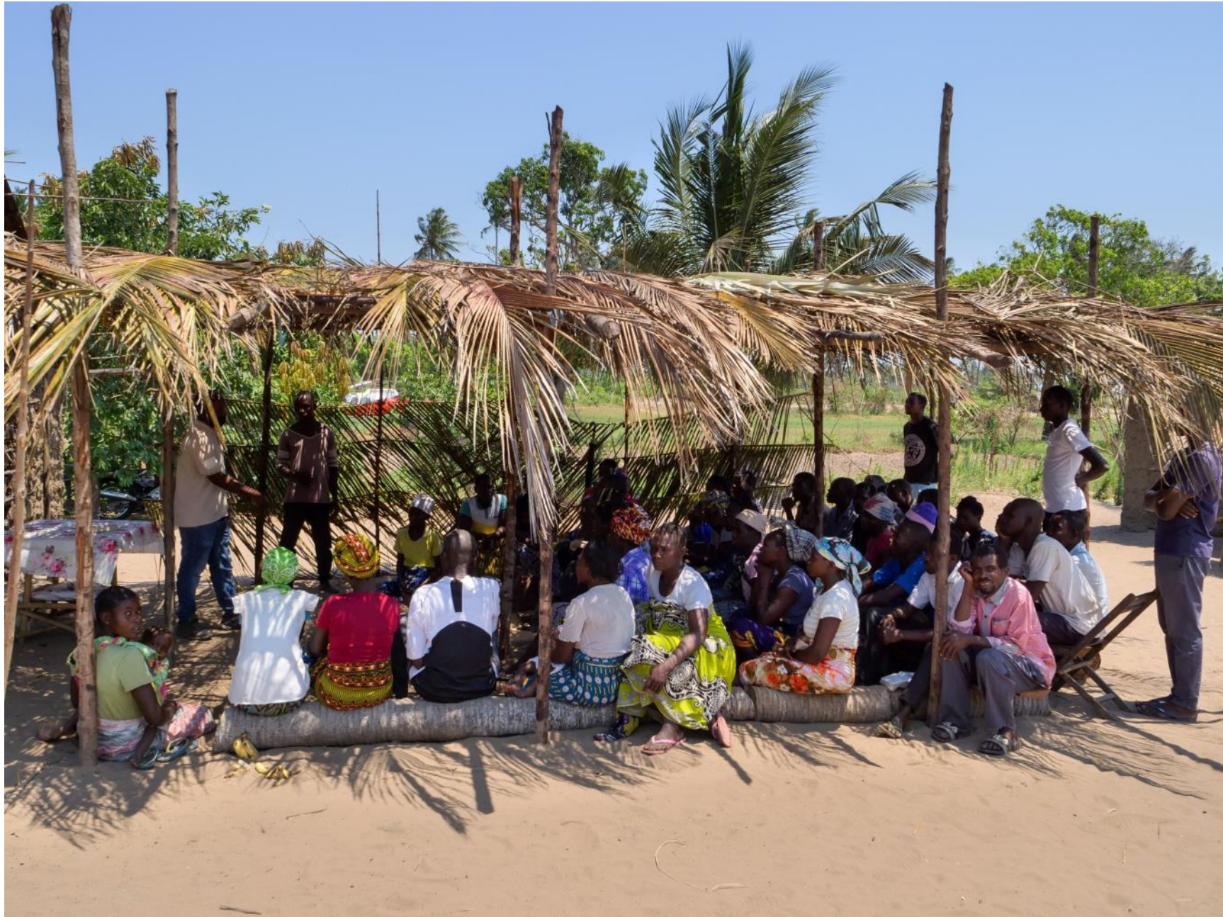
Visiting the church in Jorge