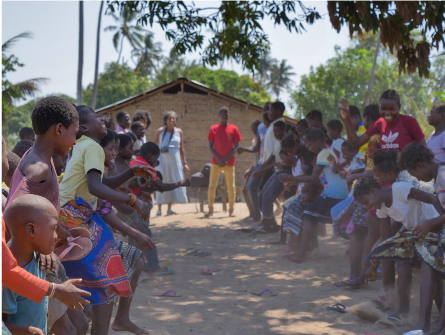
...and some new games!